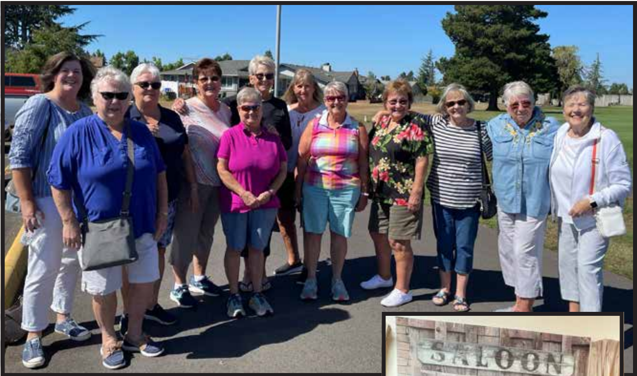
Planning committee for Snowbird Tournament Snowbird Tournament

After a 3-year hiatus, the annual Snowbird Golf Tournament returned on Aug 19-21 with a bang!