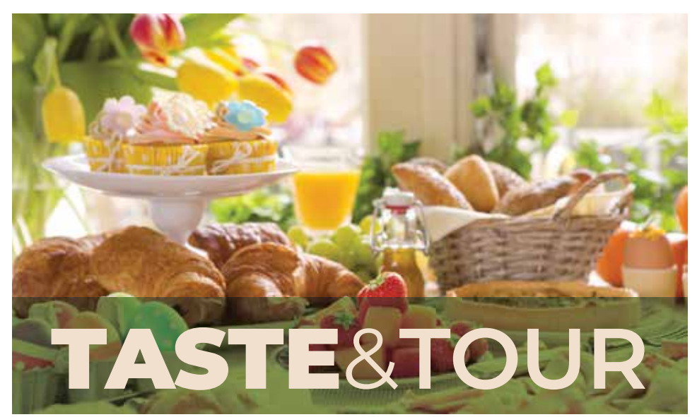
Third Sunday of the Month, 11 A.M. - 2 P.M. Cascade Park Retirement Community