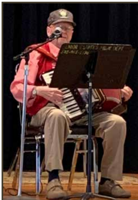
Coffee Hour Performers

P.S. If you’ve never attended and don’t know anyone to bring you, you can bring yourself! Just tell the fabulous lady at the door that you’ve never been before and she’ll let you in free—but no fibbing, because she remembers everyone who’s ever come!!!! LOL