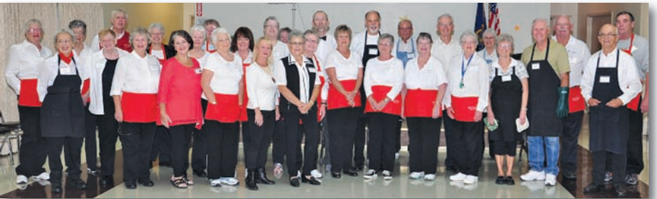
Pancake Breakfast Crew