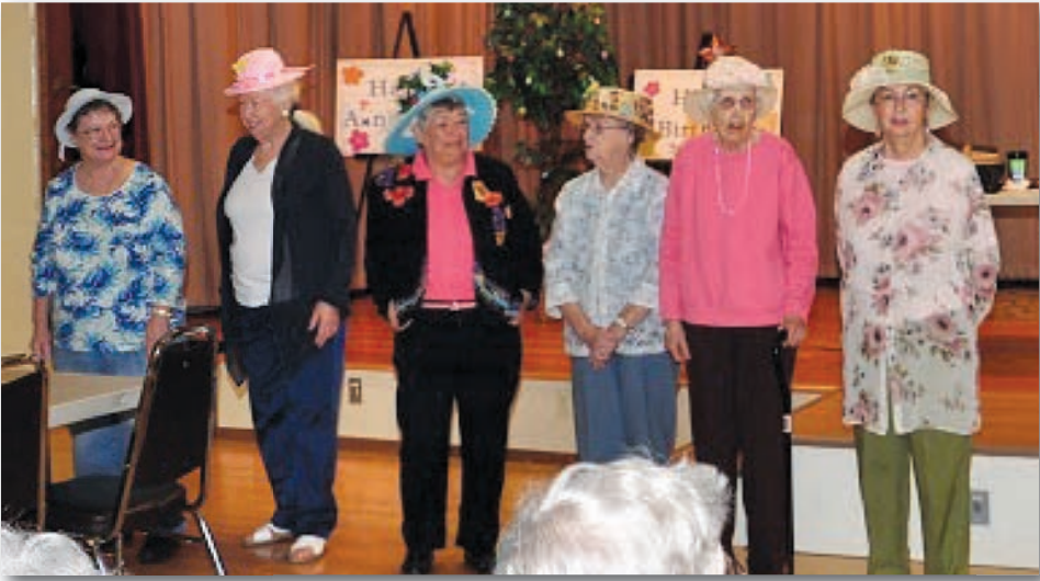
Easter Hat Review