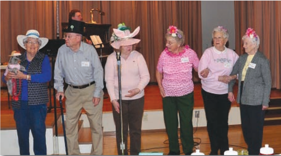
Easter Hat Review