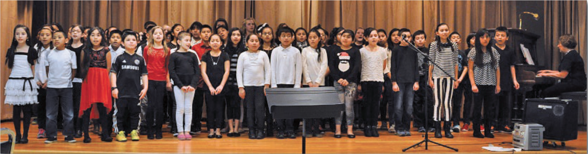
Lincoln Elementary 4th & 5th Grade Choir