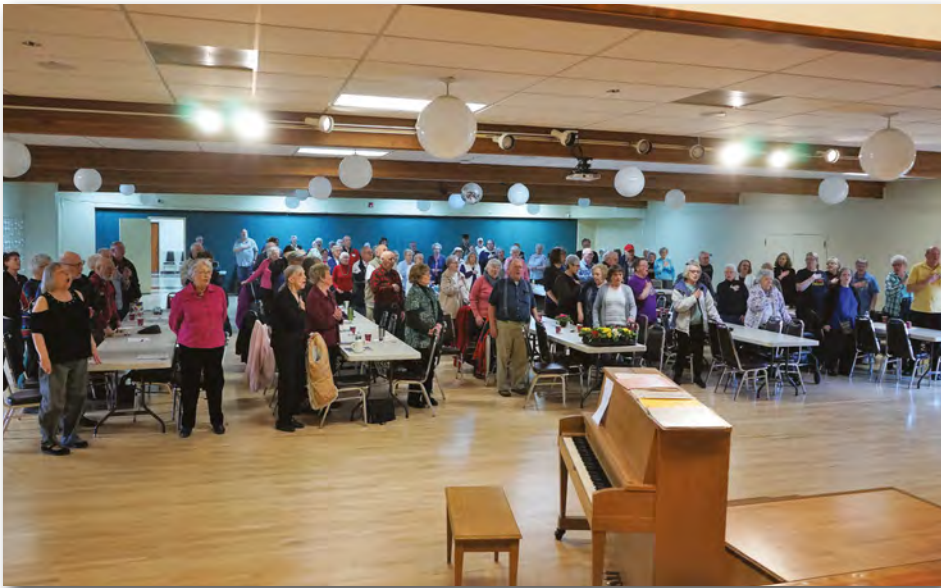
Nice crowd at February 28 Coffee Hour