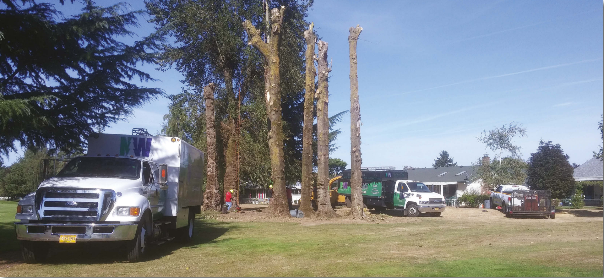
Northwest Tree Service crew