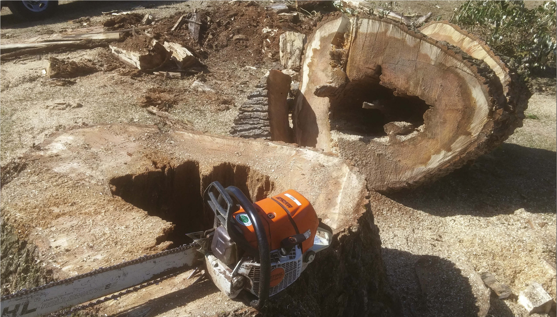
Hole in Cottonwood from East side of Hole 12