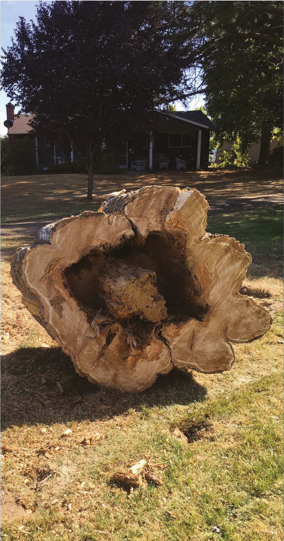
Hole in Cottonwood from West side of hole 12

For more back story on how and why this project came about, see the article on page 12.