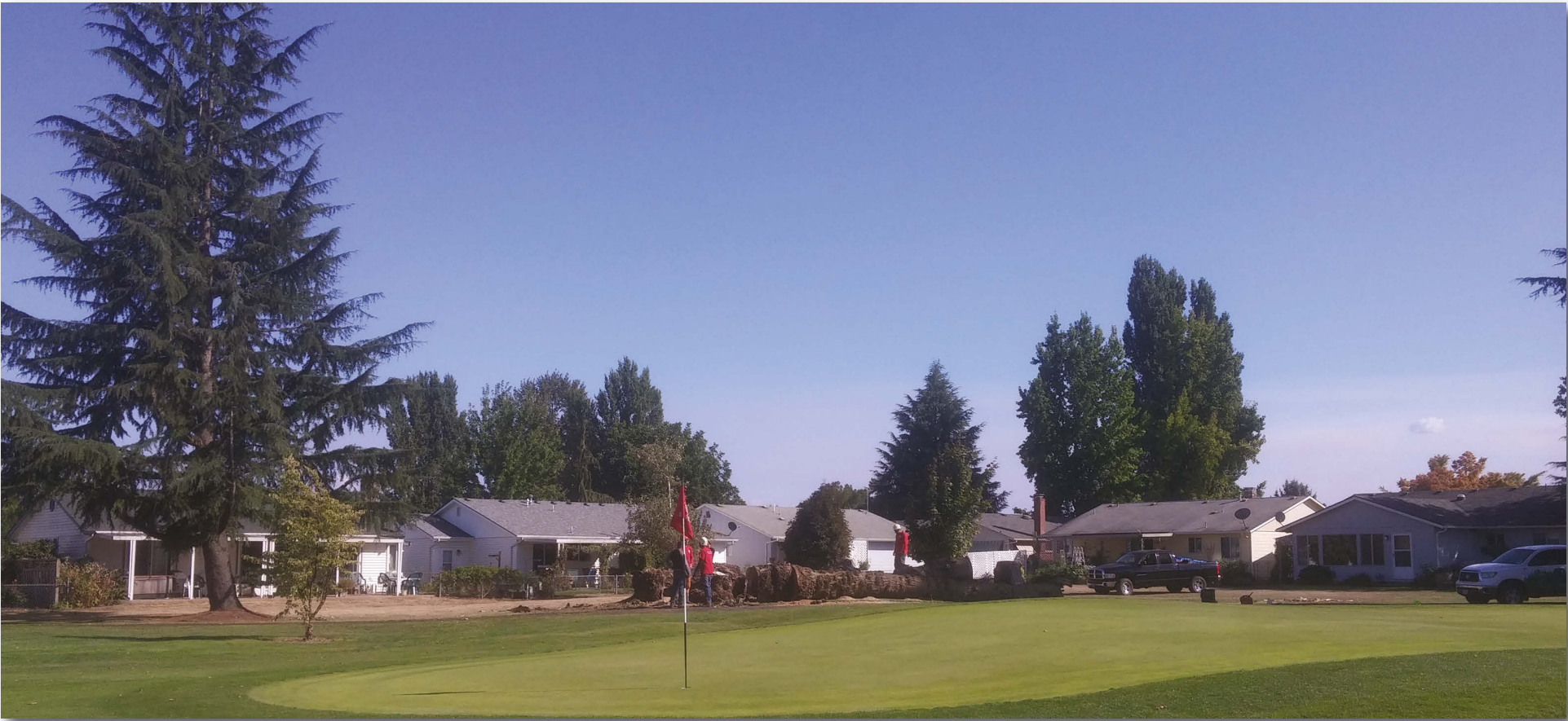
More trees gone on Hole 12