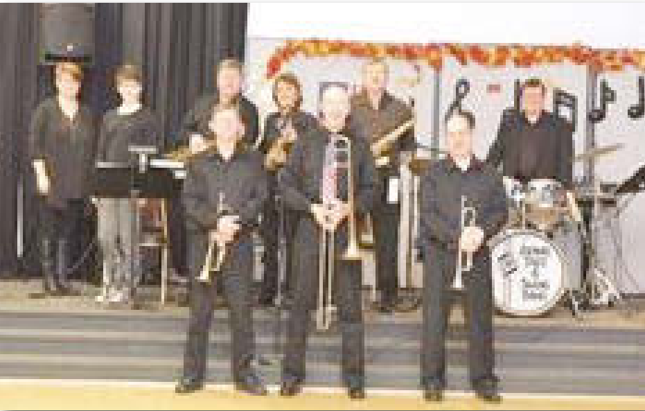
Grand Jazz & Swing Band