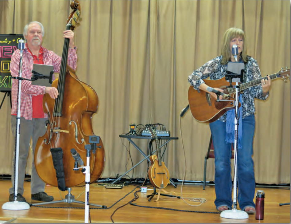
Next of Kin