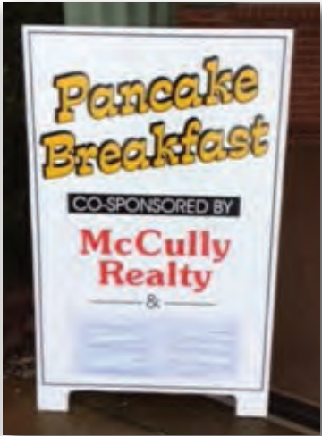
Co-sponsors McCully Realty and Legacy Financial