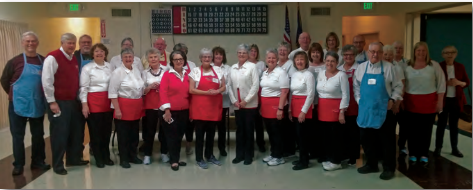
Indoor Pancake Crew