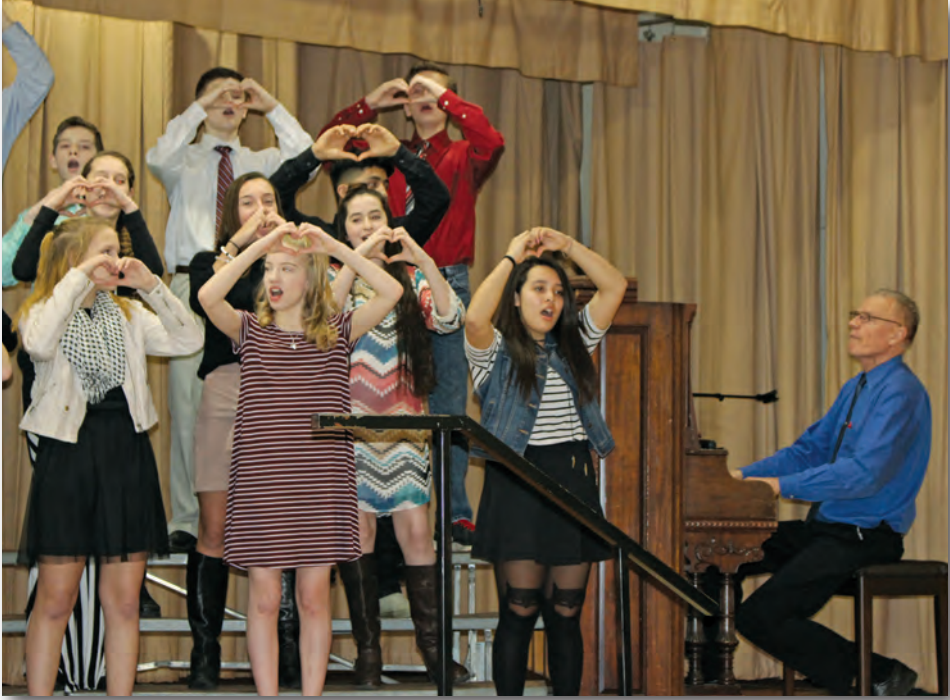
North Marion Middle School Chorus