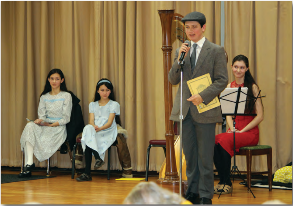
The Gallagher Family